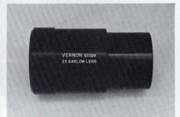
2" O.D. 2x Barlow