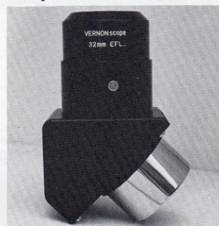
2" Amici with eyepiece

The focal ratio of f/7 was chosen for portability purposes as well as overall viewing versatility. The 640mm focal length allows for a wide range of magnifications to suit all observing requirements (48mm BRANDON gives 13x; 8mm BRANDON with 2.4x DAKIN Barlow provides 192x). At f/7 there is no noticeable coma or color, (common with fast systems), and yet the tube is still short enough to be easily transported.